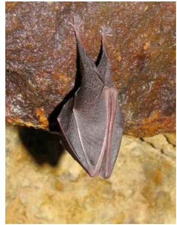
Fig. 4 - One of the R. hipposideros.

Information on the chiropteran fauna of Roșia Montană area base on two studies: „Studiu de condiții inițiale privind biodiversitatea” [“Study of initial conditions on biodiversity”] for achieving the Impact Evaluation on the Environment of the project of gold exploitation, requested by Roșia Montană Gold Corporation S.A. and carried on within the period May – August 2003 by Stantec Consulting Corporation, and the study „Specii de lilieci și statutul lor de protecție la Roșia Montană” [“Bat species and their protection status in Rosia Montană”], carried on within the period 9-11 September 2003 by the Association for Bat Protection of Romania (Nagy, 2003). Both groups of researchers visited the mining galleries and different habitats from Roșia Montană and identified the same 9 bat species.