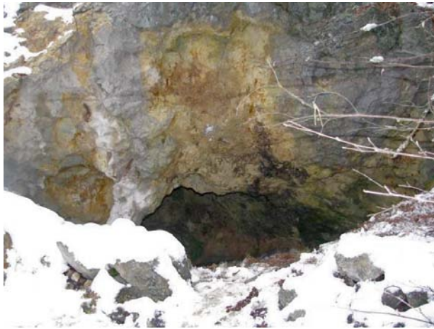
Fig. 3 - In the geological exploration gallery close to Cărnicele Peak (Photo: D. A. Pop).

balks, rocks (especially in the upper side, on the south-eastern slope of the Cărnic Massif), secondary lawns, greenlands, meadows, gardens and Corna tarn. In winter, the temperature does not fall below 10°C - 9°C in that gallery, and the wet walls maintain a relative humidity of 50 – 55%. After the single gallery entrance (Fig. 3) there is a decending “T”-shaped section of about 2 m, from where two asymmetrical ramifications start of about 3 m in the left ramus and of 5 – 6 m in the right one. The height of the left ramus gallery, where the two specimens of Lesser horseshoe bats were found, is of about 1.5 m. Location of the gallery entrance, chosen by Rhinolophus hipposideros for hibernation, in a young plantation of pine and birch can be correlated with the species preference of hunting in the bushes and young wood (Bontandina et al., 2002; Motte & Libois, 2002; Spitzenberger & Hutson, 2008). When the gallery was visited, only two individuals of Rhinolophus hipposideros (Fig. 4) were observed – species which was not reported from Roșia Montană, up to now.