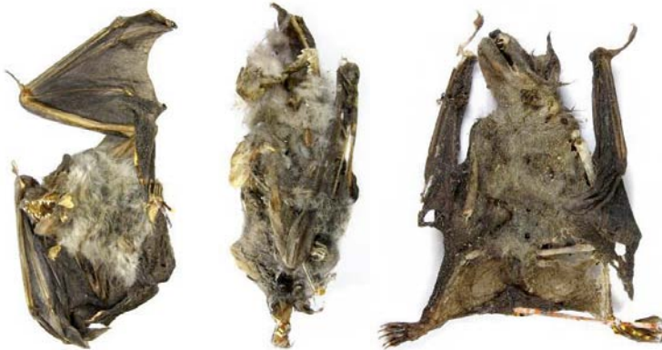
Fig. 5 - Mummified bats from Roșia Montană locality: left – Myotis myotis ; middle – M. brandtii ; right – Pipistrellus (= Hypsugo ) savii .

As it was mentioned before, from the attic of the Greek-Catholic Church of Roșia Montană locality the bodies of four individuals of three different species were collected: Myotis myotis (two individuals), M. brandtii – one individual, and Pipistrellus (= Hypsugo ) savii – one individual (Fig. 5). If Myotis myotis was identified also by the two referential studies for Roșia Montană, M. brandtii and Pipistrellus (= Hypsugo ) savii are new species, not reported till now for this location from Romania.