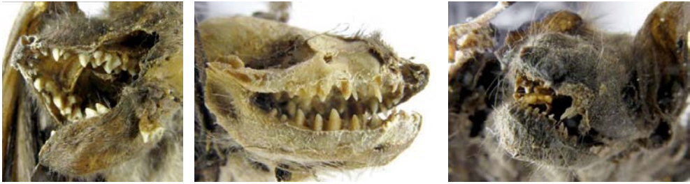
Fig. 6 - Dentition to: Myotis myotis (left); M. brandtii (middle); Pipistrellus (=Hypsugo) savii (right).

colonies. But sometimes, in summer, it can stay in the building attics, as the specimens of the present study. As regards M. brandtii , it is known its preference for the artificial shelters, nesting in the spaces between the root boarding and sheet or between laths and tiles – inaccessible dark places. As foraging habitats, it prefers the mixed forests or the deciduous ones, with pools near them, and as hibernation roosts, it prefers the caves, basements and mine galleries (Boye (2004); Boye et al. (1999); Ifrim & Valenciu (2006); Nagy et al. (2005)). So that, nursery roosts are left in autumn, when mixed colonies gather again for mating, and then withdraw in caves or galleries for hibernation. At the same time, the species is known as an occasionally migratory one (Hutterer et al., 2005 in Hutson et al., 2008), seasonal trips being of 200 – 250 km sometimes. That is why, we have to take into account the habit of the individuals of changing the hibernation places every year, when estimating the populations of M. brandtii ; the results of the observations made during the same period, for 2 - 3 years, may be closer to the real tendencies of the populations of this species.