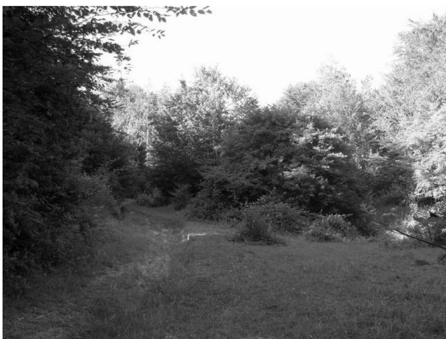
Fig. 2 – Above, woodside of the deciduous forest, mixed with sting nettle ( Urtica dioica ), hazel ( Coryllus avellana ), alder ( Alnus glutinosa ) (1 st of July 2008). Bottom, the bush area at the spruce fir forest woodside ( Picea sp.) and sloping land with beech forest ( Fagus sylvatica ), cleared, now with twigs, bushes (2 nd of July 2008).