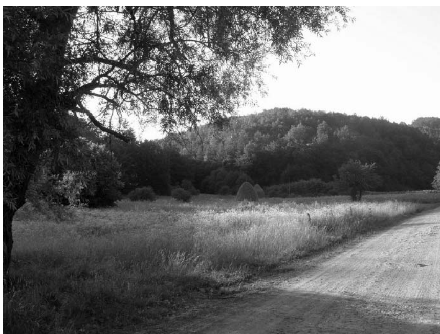
Fig. 3 – Above, riparian area of the Baia streamlet and of the little tributary with sting nettle ( Urtica dioica ), alder ( Alnus glutinosa ), hazel ( Corylus avellana ), chamomile ( Matricaria chamomilla ), klammath weed ( Hypericum perforatum ), blackberry ( Rubus idaeus ). Bottom, lawn area with subarbooreal vegetation at the deciduous forest belt from the surroundings of Baia locality.