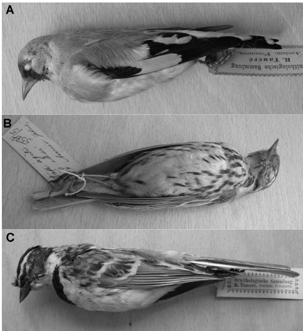
Fig. 1 - A, Carduelis carduelis caniceps Vigors, 1831; B, Anthus trivialis Linnaeus, 1758; C, Emberiza elegans Temminck, 1836.

Rudolf Tancré's bird collection was sold to some European museums. A part of this collection can be found in Zoölogisch Museum of University of Amsterdam (The Netherlands), in Zoologisches Forschungsinstitut und Museum Alexander Koenig, Bonn (Germany), in Staatliches Naturhistorisches Museum, Braunschweig (Germany) (Roselaar, 2003), Museum Upper Austria – Linz, in Theodor Angele's collection (Aubrecht, 2002).